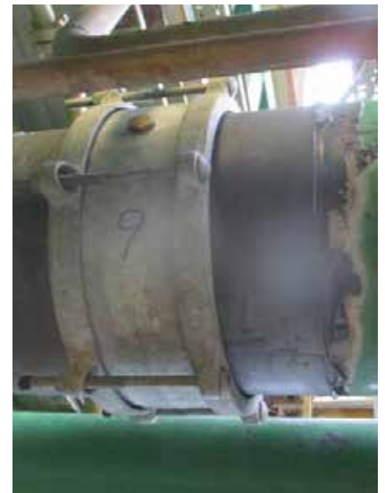
Reinstalled repaired coupling

For more information, please contact your local Belzona representative: